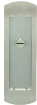
FH2904 Flush Pull w/ Thumbturn Release